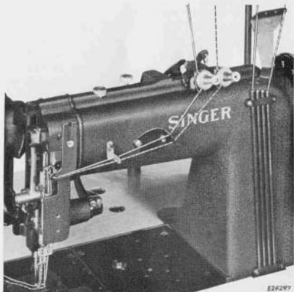
Fig. 16. Needle Threading

To thread needles, pass thread through threading points in the order shown in Figs. 15 and 16. Dotted line indicates thread for left hand needle.